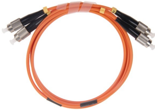
FC to FC OM2, duplex