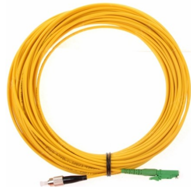
FC to E2000 SM, simplex