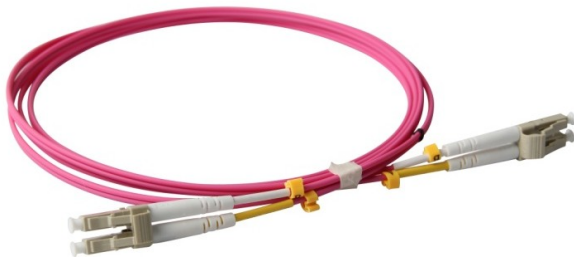
LC to LC OM3, duplex