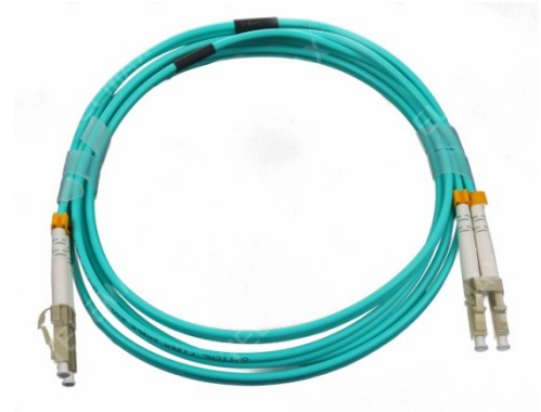
LC to LC OM3, duplex