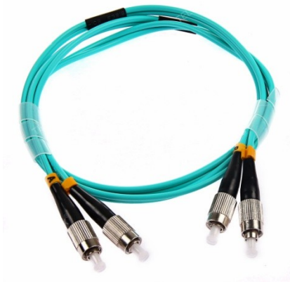
ST to ST OM3, duplex